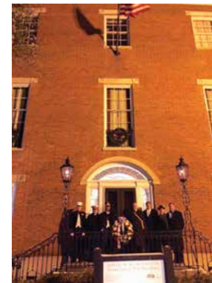
The D.C. Society and Military Society presenting a wreath in honor of Commodore Stephen Decatur at Decatur House on Lafayette Square.